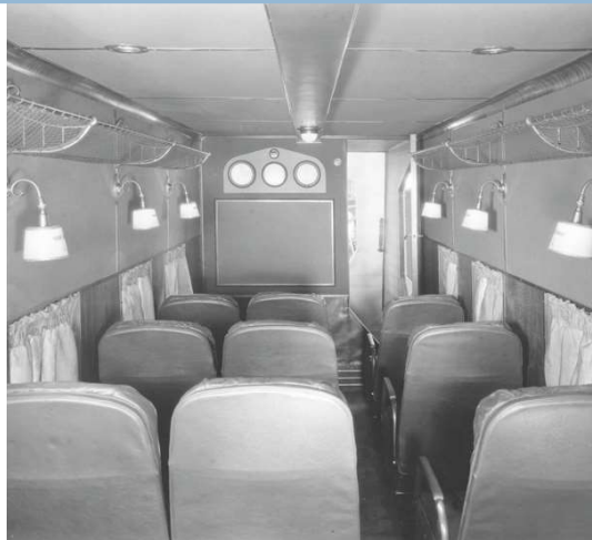
BOEING MODEL 80