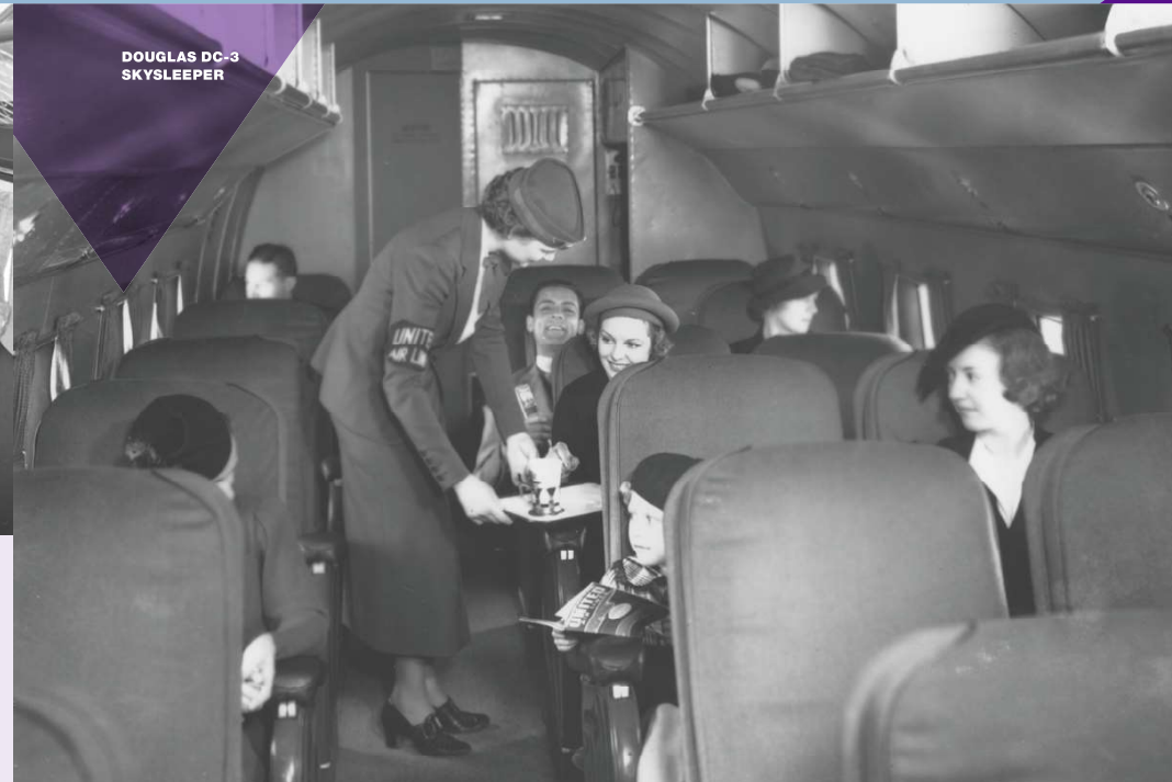
DOUGLAS DC-3 SKYSLEEPER