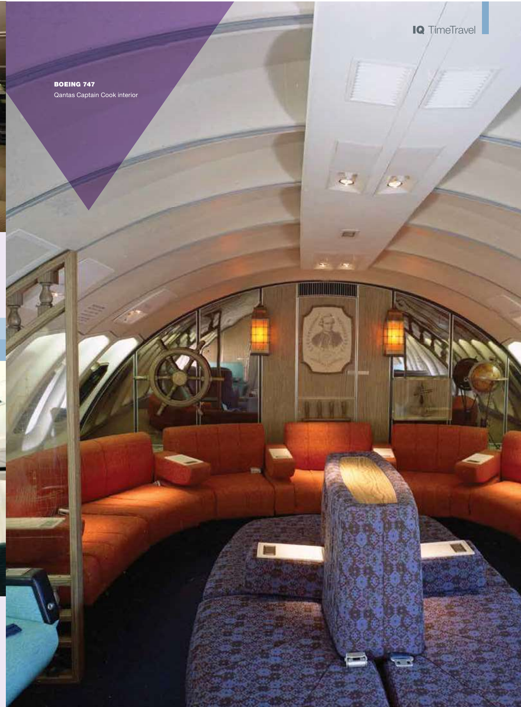
BOEING 747 Qantas Captain Cook interior

On the 747, overhead bins replaced the conventional hat rack-style storage, securing luggage in case of turbulence.