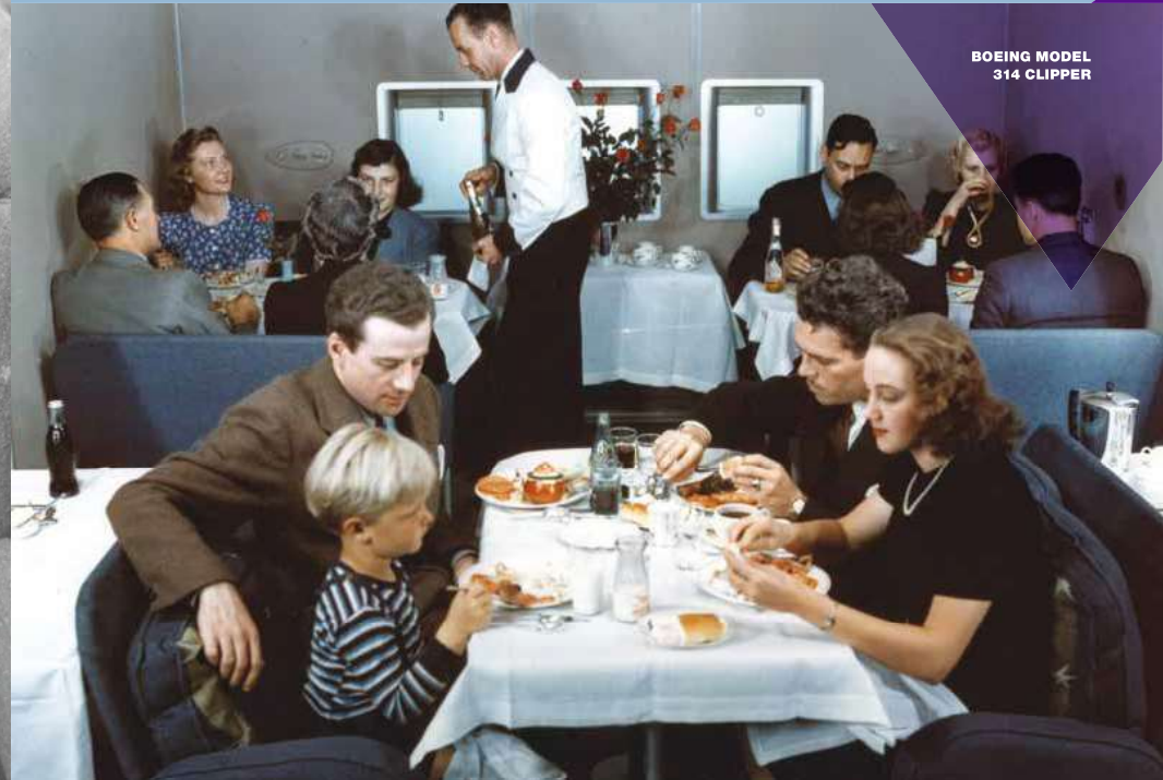
BOEING MODEL 314 CLIPPER