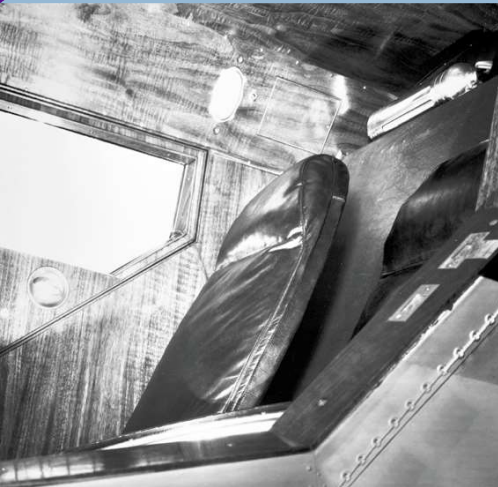
BOEING MODEL 40A