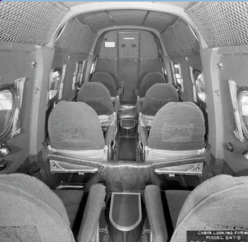
BOEING MODEL 247