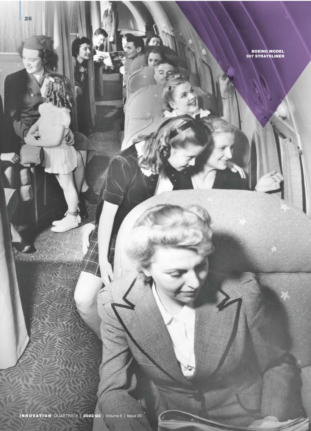
BOEING MODEL 307 STRATOLINER

The next major advancement in the passenger experience came with more powerful airplanes that could fly at higher altitudes. The Boeing Model 307 Stratoliner was the world's first high-altitude commercial transport and the first four-engine airliner in scheduled domestic service.